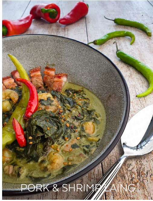
PORK & SHRIMP LAING