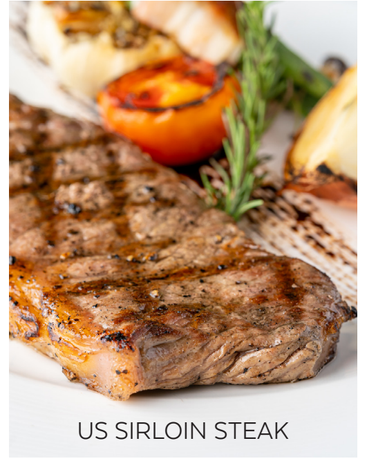
US SIRLOIN STEAK