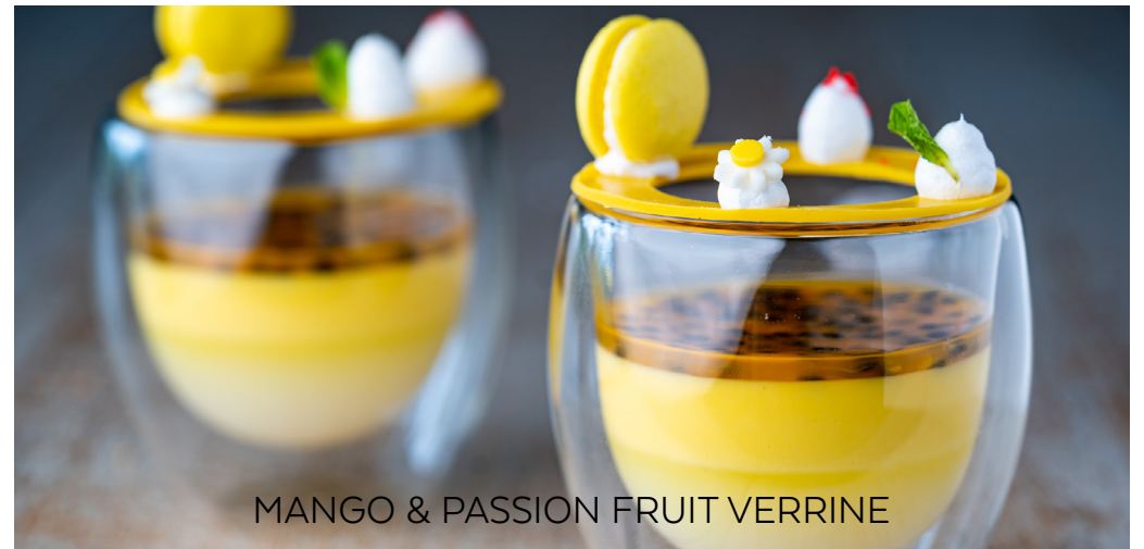
MANGO & PASSION FRUIT VERRINE