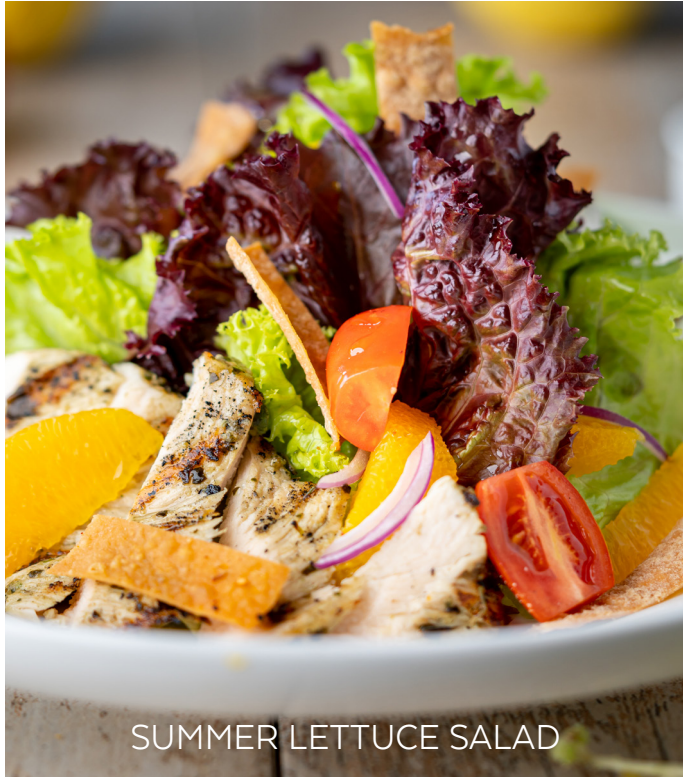
SUMMER LETTUCE SALAD