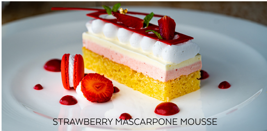
STRAWBERRY MASCARPONE MOUSSE